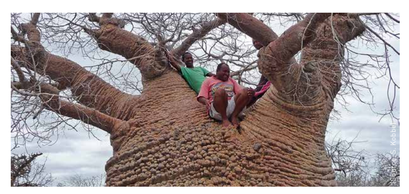
The Baobab tree with its vast water storing trunk is characteristic of Madagascar's dry regions.

■ The south-west of Madagascar is regarded as one of the poorest parts of the island. For the people who live here, survival is often difficult in this region plagued by drought. Now, however, experts from Germany and Madagascar are trying not only to improve the living conditions of the native population but also to ensure better protection of the island's unique flora and fauna in the SuLaMa research project.