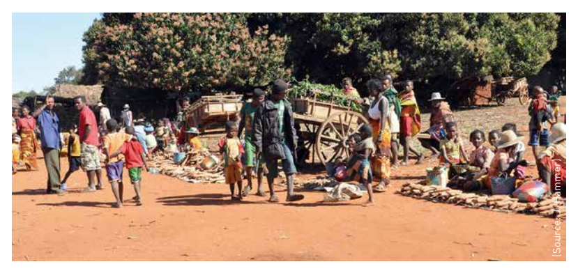
The few natural and agricultural products are traded at small local markets.

Why which taboos and rules exist is often unclear and just one of the many questions to which social