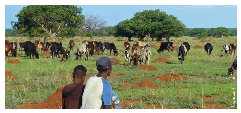
Zebus are not only work animals and a source of meat but also a status symbol and an investment.