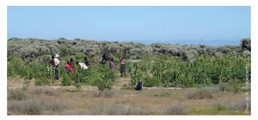
The people on the Mahafaly Plateau live essentially by transhumance and animal husbandry.

Scientists from the University of Kassel have therefore laid out trial fields in several villages on the Mahafaly Plateau where they are using cattle and goat dung and charcoal to fertilize manioc, or cassava. They wish to investigate how productivity and nutrient availability can be increased using varying dosages of different fertilizers. Local farmers are also participating in the trials, and discuss the results with the scientists at information events and workshops. »If the experiments bring visible positive results, those farmers who are open to innovation will also want to spread dung on their fields«, reports Dr. Katja Brinkmann, who is conducting research at the Department of Ecological Plant Cultivation and Agricultural System Research in the Tropics and Sub-Tropics (OPATS) of the University of Kassel. Joint field trials with local farmers are also taking place in two other villages, where