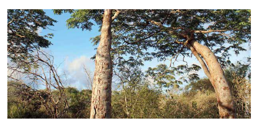
Tamarinds not only provide the people with fruit and timber but also hold particular cultural significance for them.

syrup; they also have important socio-cultural value. »These are sacred trees, believed by the villagers to be inhabited by spirits and natural beings who must be treated with due respect«, explains Fritz-Vietta. Use may be made of the trees, provided that the natural beings agree to this.