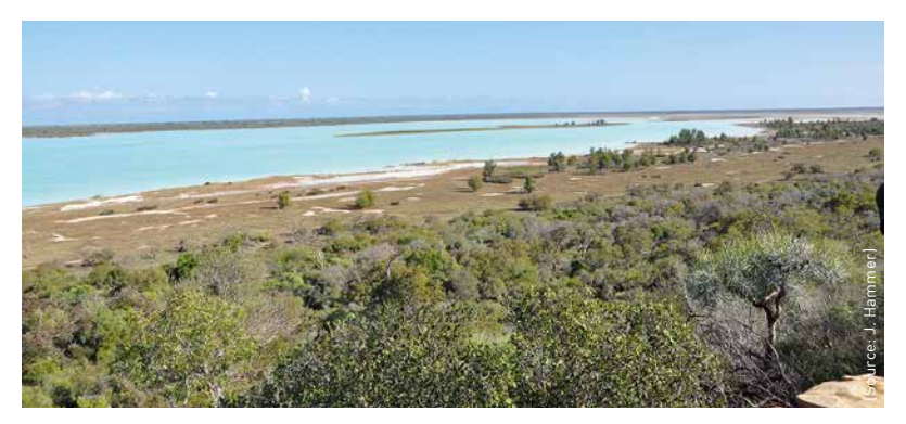
Lake Tsimanampetsotsa is a 15-kilometre long salt lake which gives its name to the national park in the study region.

Forestry scientists, economists, agronomists and social and cultural scientists from Germany and